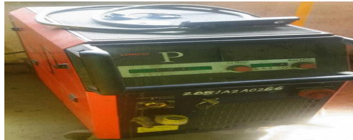
Fig. 1 Photographic view of GMA welding machine undefined