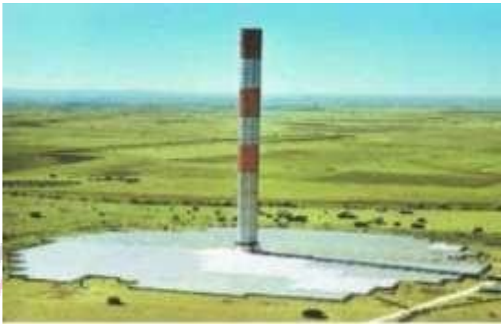
Fig.1. Solar chimney power plant in Manzanares

Since then, several works were performed on solar chimney power plants [4]. The experimental ones are based essentially on the data gotten at Manzanares prototype. During the production of the useful energy system, the energy conservation is among one of the most important goals. This is why the study of the second law of thermodynamics is of great importance. Indeed, minimizing the generation of entropy improves heat transfer and consequently increases the efficiency of energy use [5].