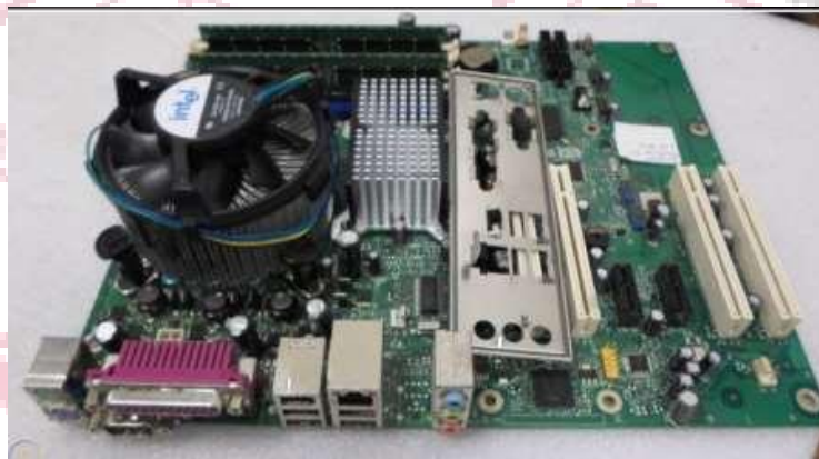
Figure 2: Heat sinks CPU arrangements